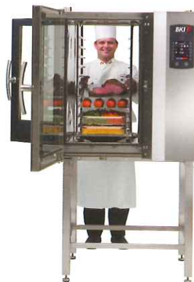
CPE 1.10 Pass Thru