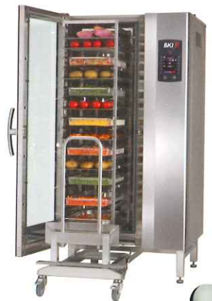
CPR 1.20 Roll-In